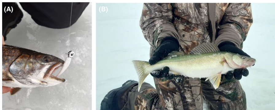
FIGURE 2. Photographs of (A) a splake (Lake Trout Salvelinus namaycush × Brook Trout S. fontinalis ) and (B) a Walleye being landed on the ice. During this time, fish are exposed to a variety of stressors, including air exposure, handling, and subzero air temperatures, which can induce the stress response in the animal. In the case of the splake (panel A), the bait is still hooked in the animal's mouth and needs to be removed. The hook set is shallow and minor and is unlikely to cause any postrelease mortality. Many anglers like to display and photograph their catches (panel B), which has the potential to extend air exposure durations.

To date, we lack information on what happens to ice-angled fish after they are released. Specifically, behavioral responses to ice angling and the potential for prolonged effects are almost completely unstudied. This paucity of information hinders the ability of fisheries managers and other stakeholders to ensure that populations are managed appropriately. There are three outcomes of C&R angling during the winter that could potentially have lasting effects on released fish, including stress impacts on behavior, slowed metabolism that may delay recovery and healing, and increased metabolic expenditures that may affect growth and reproduction (Figure 1). Below, we explore these potential outcomes in more detail; however, given